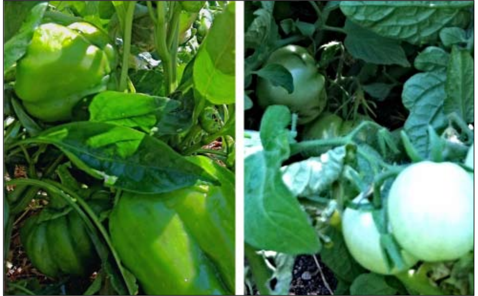
With the arrival of monsoon season, tomatoes are setting, and peppers are gearing up for production. We can look forward to midsummer harvests for the Pantry!