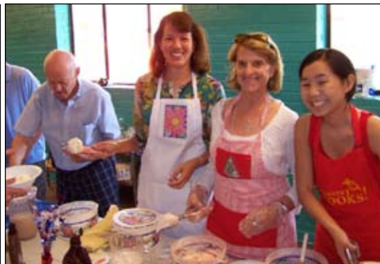
Far left: Kids of all ages enjoyed the ice cream and fun at GSP's Ice Cream Social on Sunday, July 1.